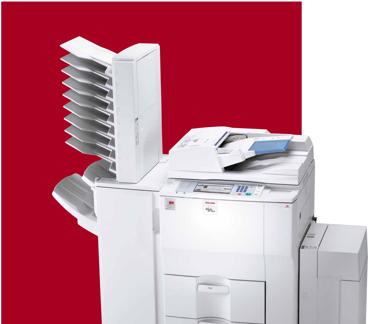
Aficio™ MP 5500/MP 6500